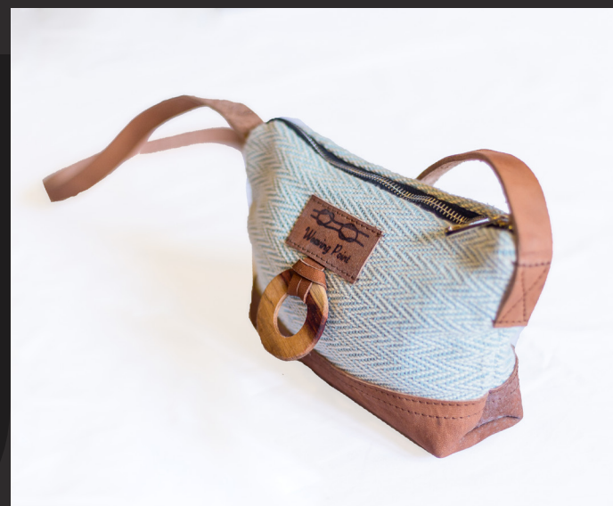
Body bag. Wash bags, Dopp kit