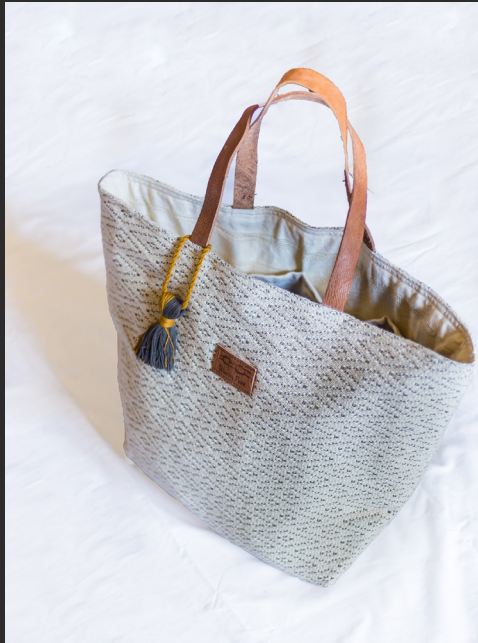
Beach Bag: leather handle