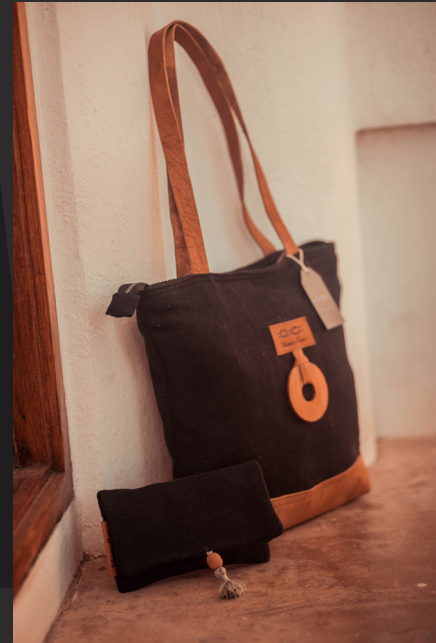
Tote Bag: Leather Bottom & leather handle