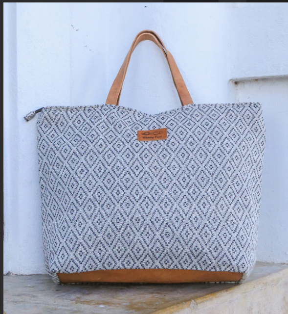
Travel Bag: Leather Bottom & leather handle